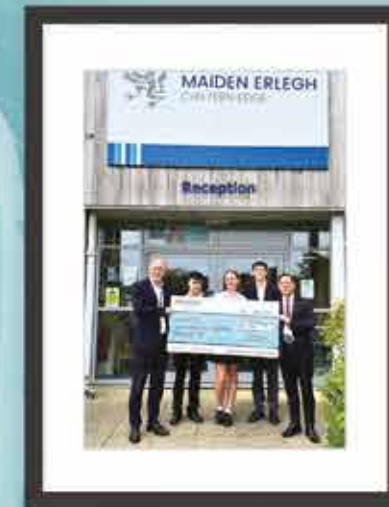
Maiden Erlegh Chiltern Edge MECE