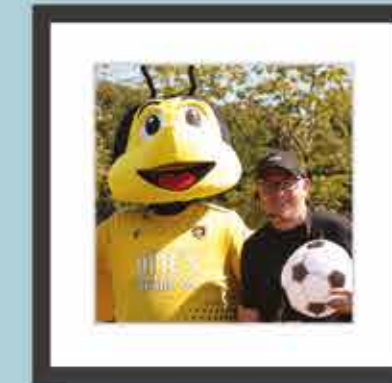
Rotherfield United Community Day