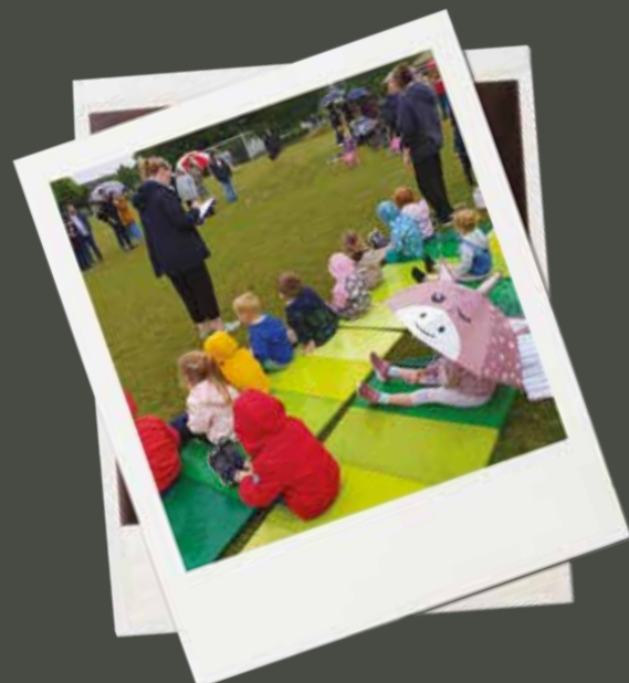
Sonning Common Pre School Family Fun and Sports Day

In addition to the recent donation to Maiden Erlegh Chiltern Edge School, Bridges recently sponsored the Rotherfield Football Club's 50th anniversary community event.